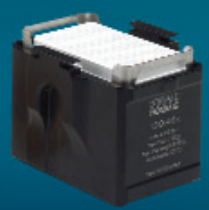
DoubleSpin<sup>™</sup> bucket containing 8 standard microplates

LH-4000 rotor with DoubleSpin<sup>™</sup> buckets